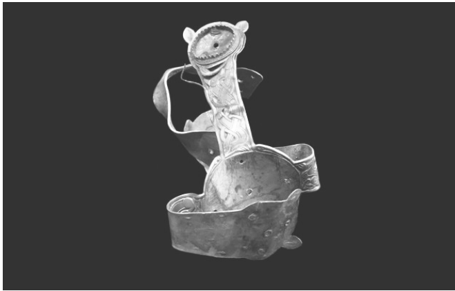
Ill. 3. The 'folded cross' from the Staffordshire Hoard

Although it must be treated as a pure hypothesis the fear of the mayor of the palace that this Hadrian might have some kind of diplomatic mission from Byzantium is perplexing. This fragment spurs many questions: why does he stop him and not Theodore? Why he thinks that the emperor might be interested in an alliance with the English kingdoms against his rule? Were there similar attempts made in the past? Or is this just an example of Merovingian paranoia in full blossom? Unfortunately we do not have answers to those questions.